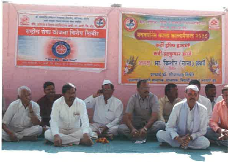
Invited Poets in Poetry Symposium at Kasewadi.