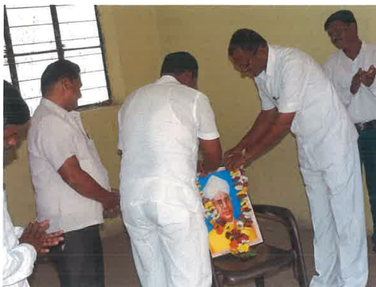
Dr. Sarvapalli Radhakrishnan Birth Anniversary Celebrated as a National Teachers Day.