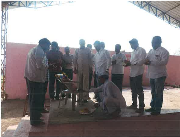
NSS Camp Inauguration Program at the hands of a Villagers.