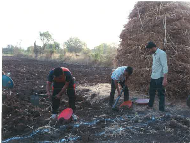
Students at Actual Work.