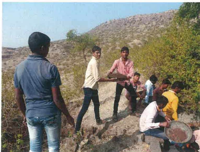
NSS Volunteers at Physical Work.