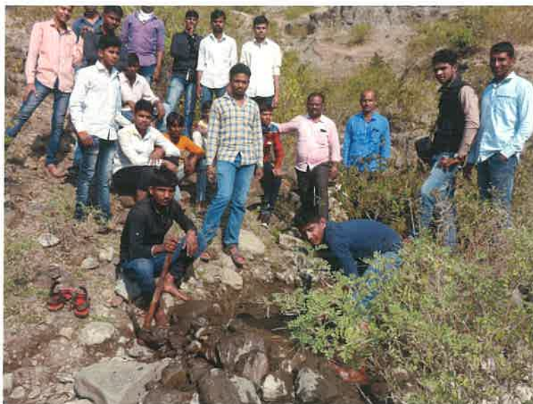
NSS program officer with Students in Youth for Water Conservation.