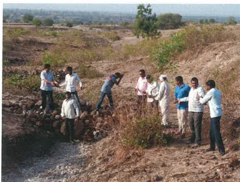
Villagers in Shramdan Shibir.