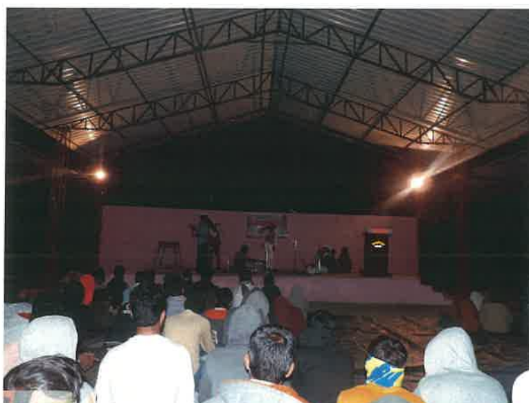
Religious Lecture on Social Reformation.