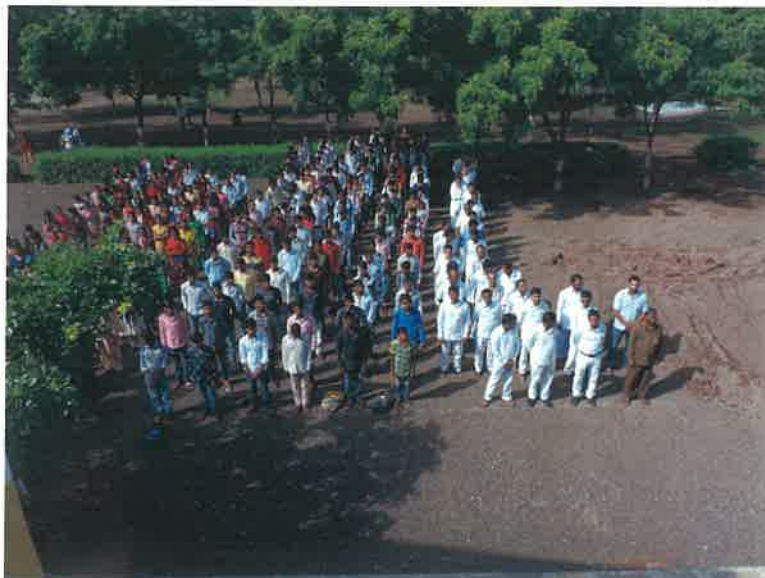
Dr. Babasaheb Ambedkar Marathwada University 59th Foundation Day Students Taking Oath