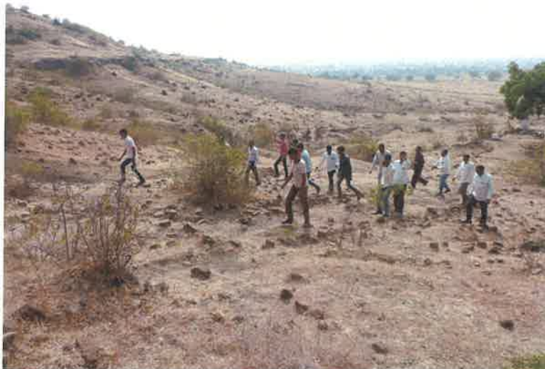
NSS volunteers in Youth For Water Conservation.