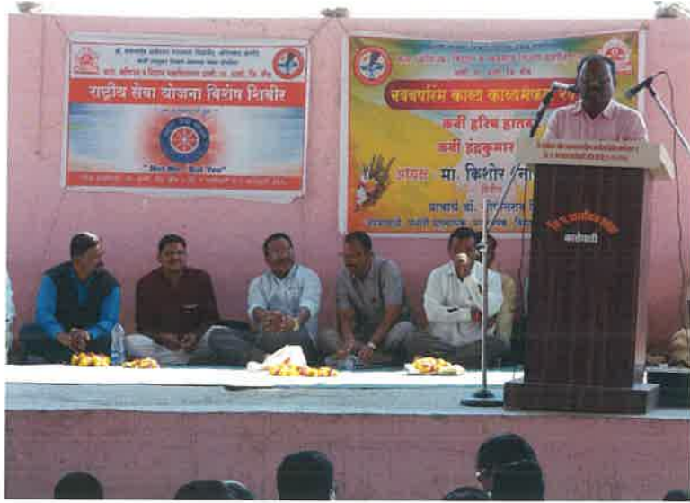
NSS Camp Poetry Symposium.