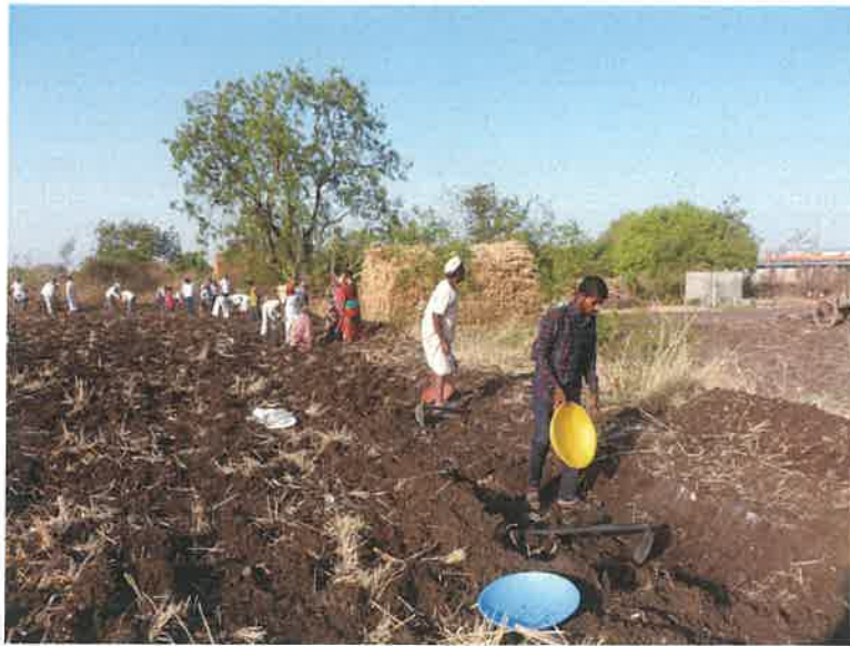
Villagers with NSS Volunteers.