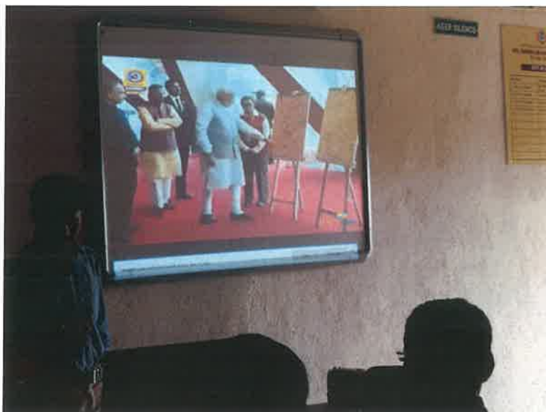
Broadcasting Watching Man ki Bat