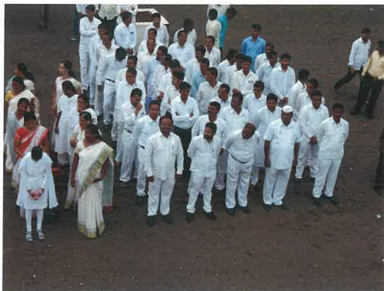
Celebrating 71th Independence Day Flag Hoisting Staff and Students.