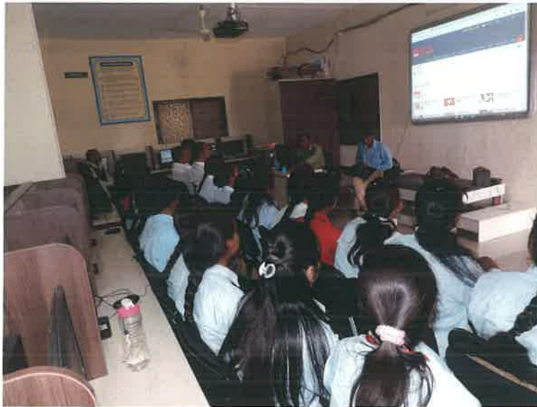
Students Watching Man ki Bat.