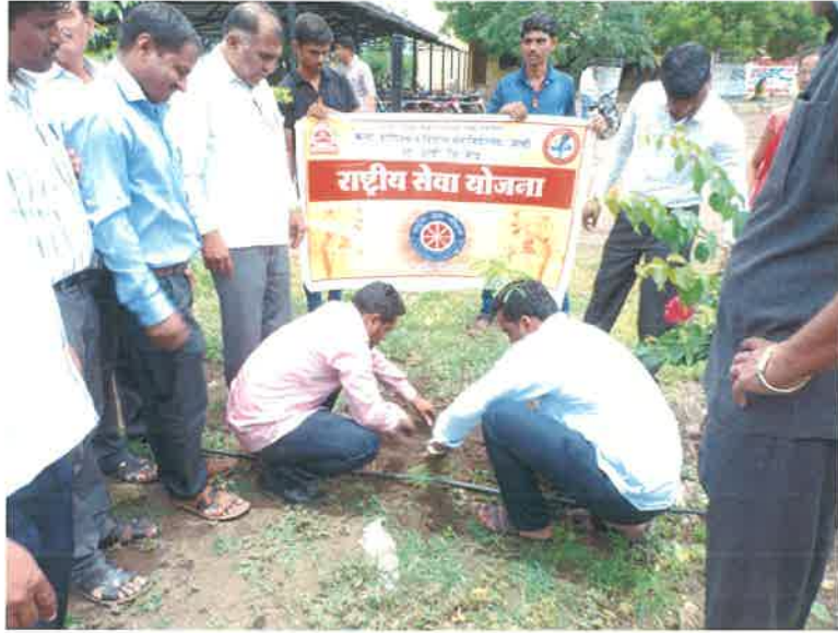
Tree Plantation Program.