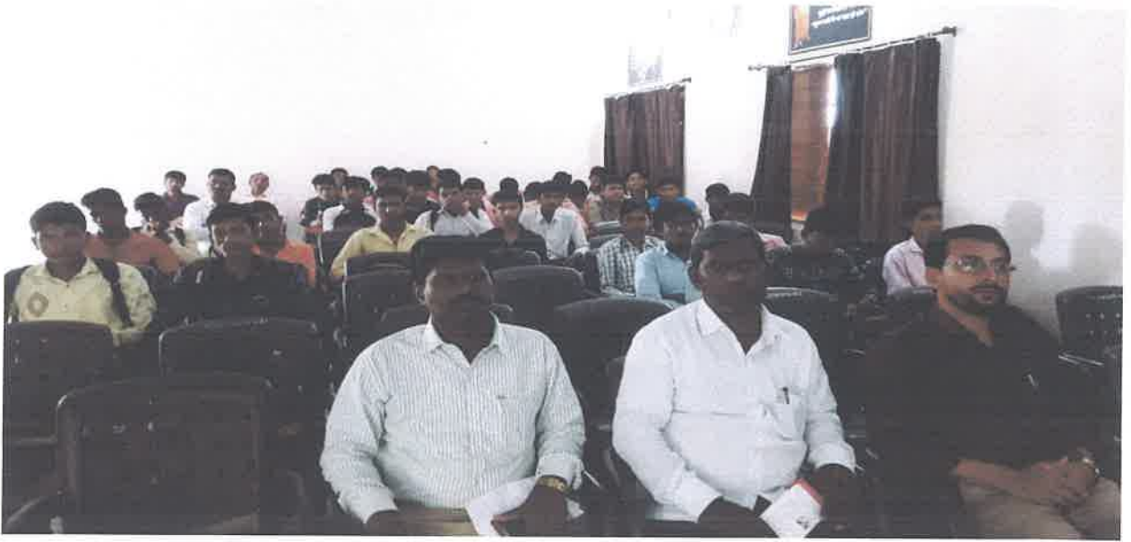
College Teaching staff and students at Health Awareness programme.

PRINCIPAL Arts, Commerce & Science College, Ashti Tal. Ashti Dist. Beed