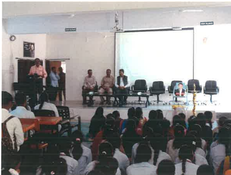
Hon.Sanjay Moon Inaugurate the Vocational Guidance Camp.