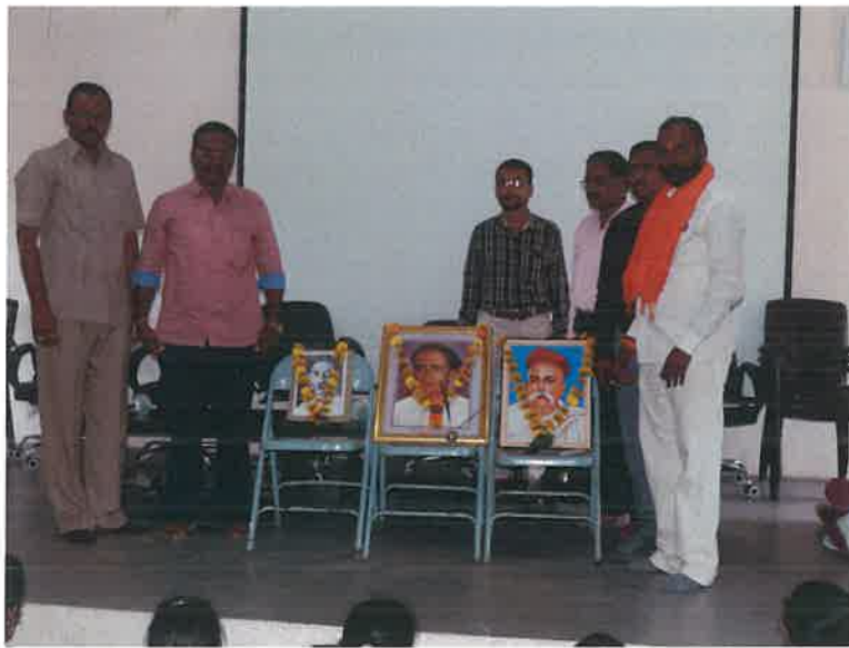
Celebrating Birth Anniversary of Annabhau Sathe, Munshi Premchand & Death Anniversary of Lokmanya Tilak.