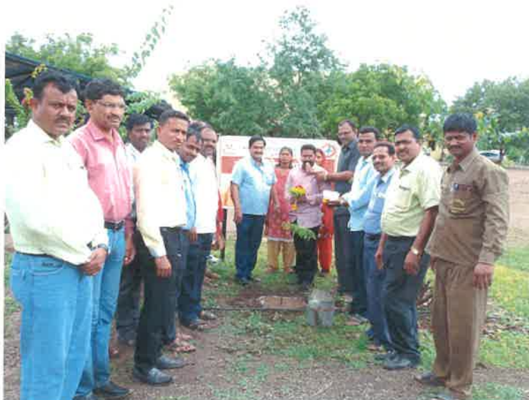
Tree Plantation Program.