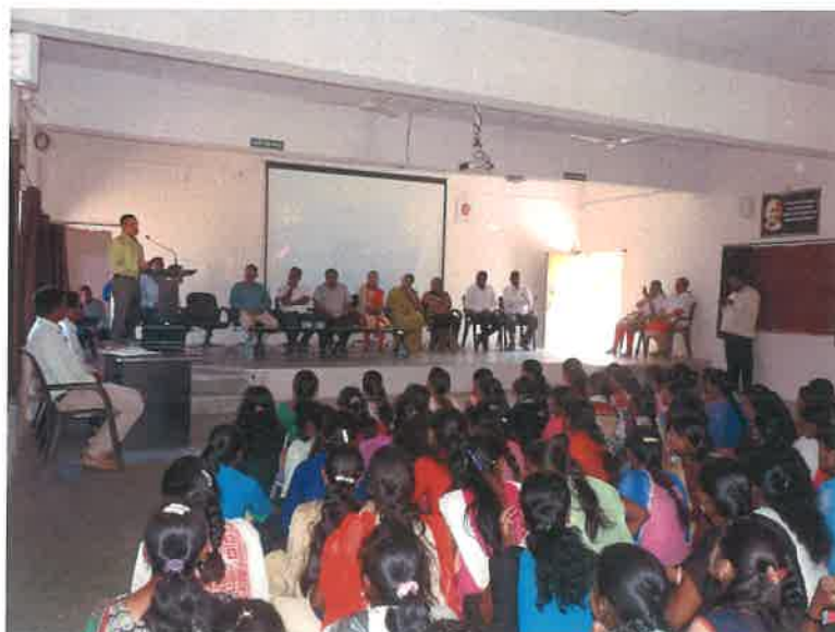
Girls Health Checkup And Guidance Camp.