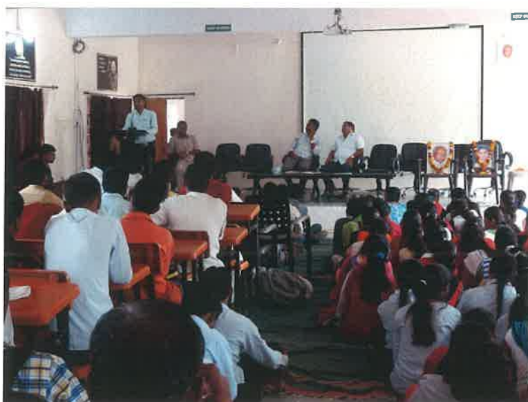
A Student expressing her views in Marathwada Liberation Day Program