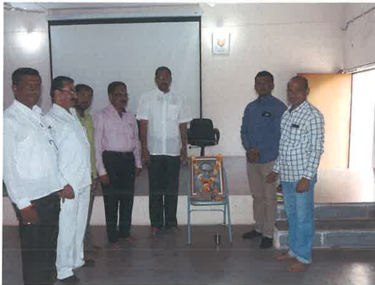
The Principal And Staff Celebrating the Birth Anniversary of Dr. Babasaheb Ambedkar.