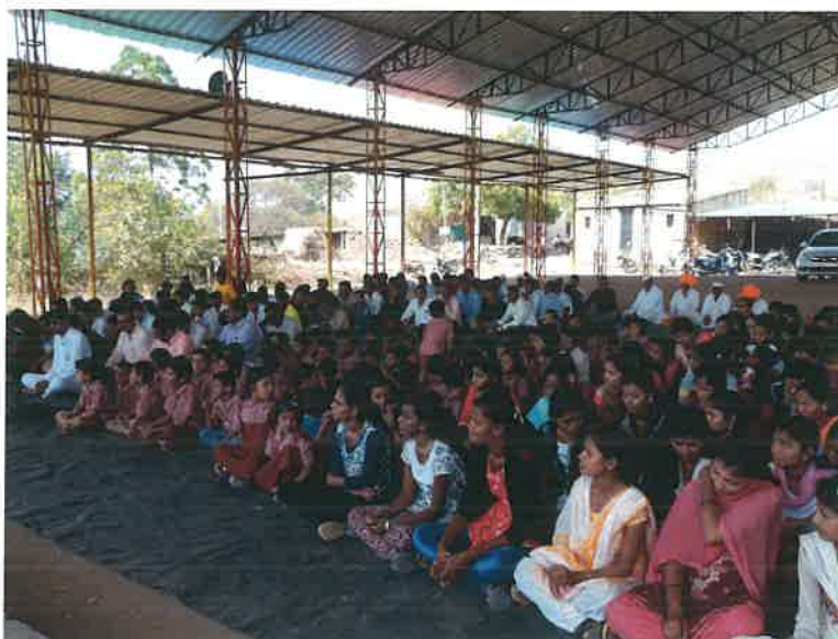
NSS Volunteer and Villagers in Valedictory Function.