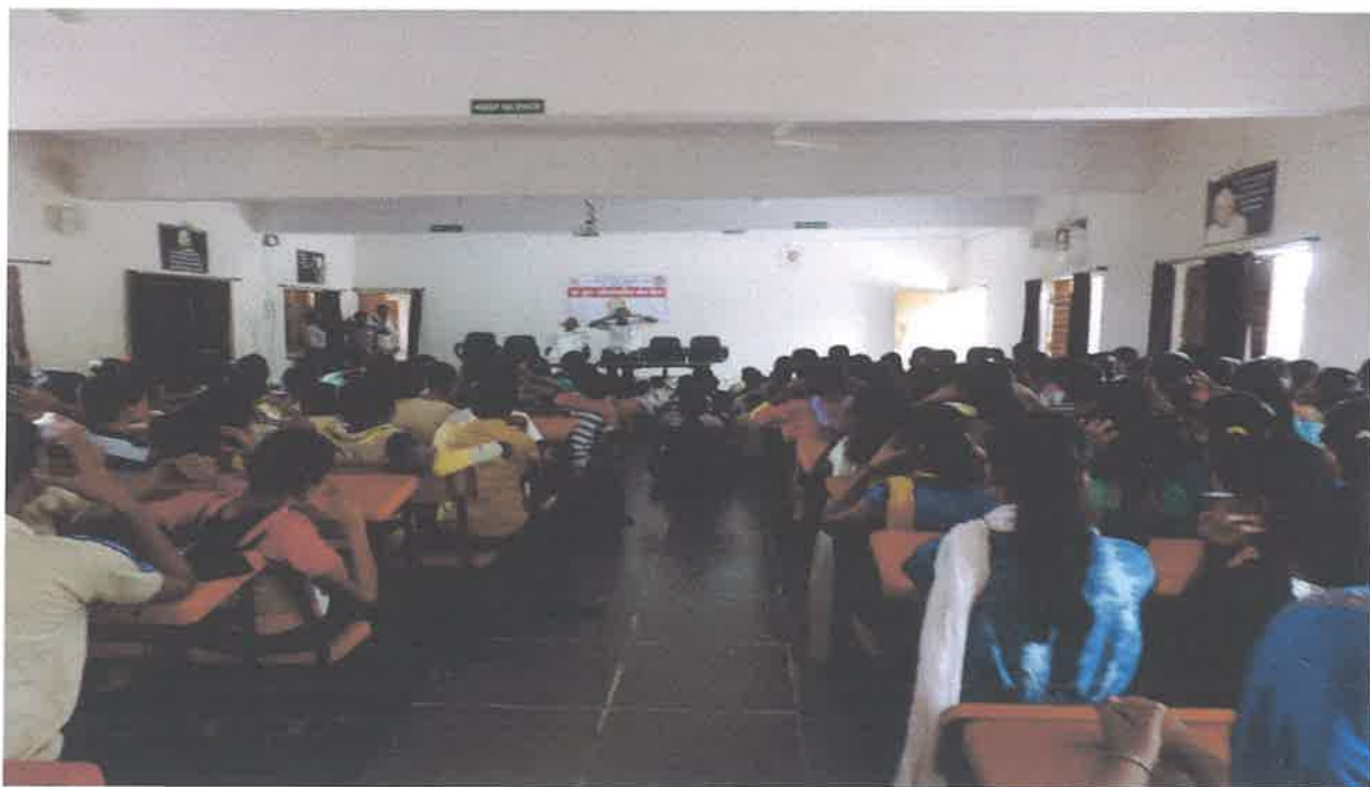
College staff and students doing yoga exercise at the 'International Yoga day'