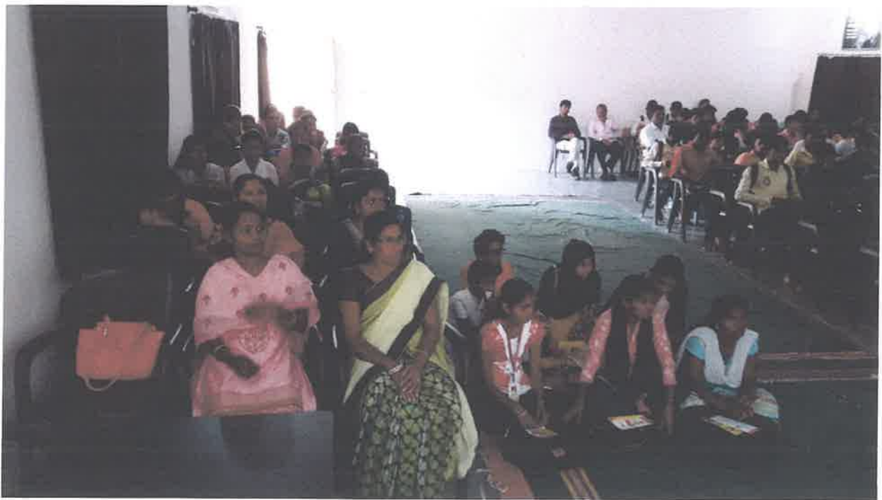
College staff and students at Health Awareness Event.