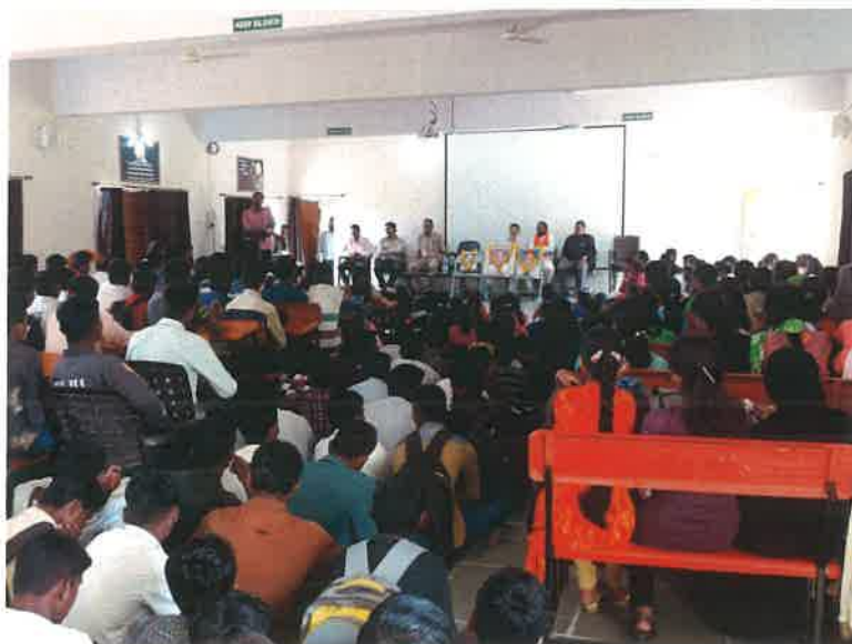
Celebrating Birth Anniversary of Annabhau Sathe, Munshi Premchand & Death Anniversary of Lokmanya Tilak.