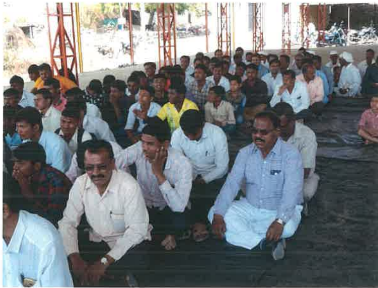
NSS Volunteers & Villagers in orientation Program.