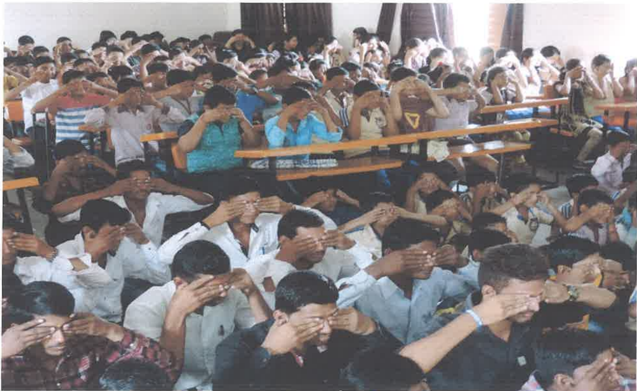
College staff and student doing yoga exercise at the International Yoga Day.