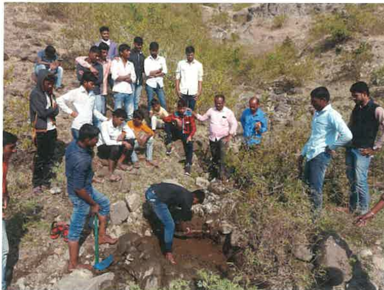
NSS volunteers at actual work in Youth for Water Conservation.