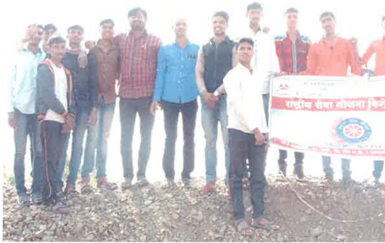
NSS Volunteers after Completion of work