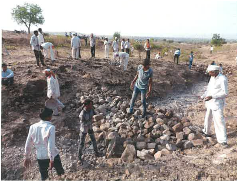
Students and Villagers in Shramdan Shibir.