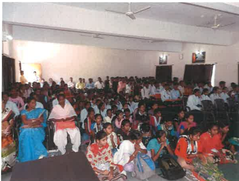
Students in Audience.