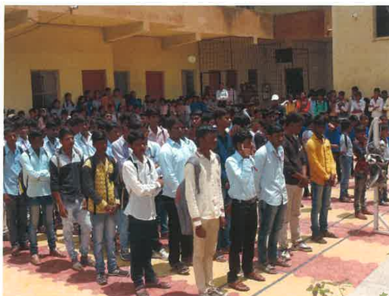
Students Present in a Teachers Day Program.