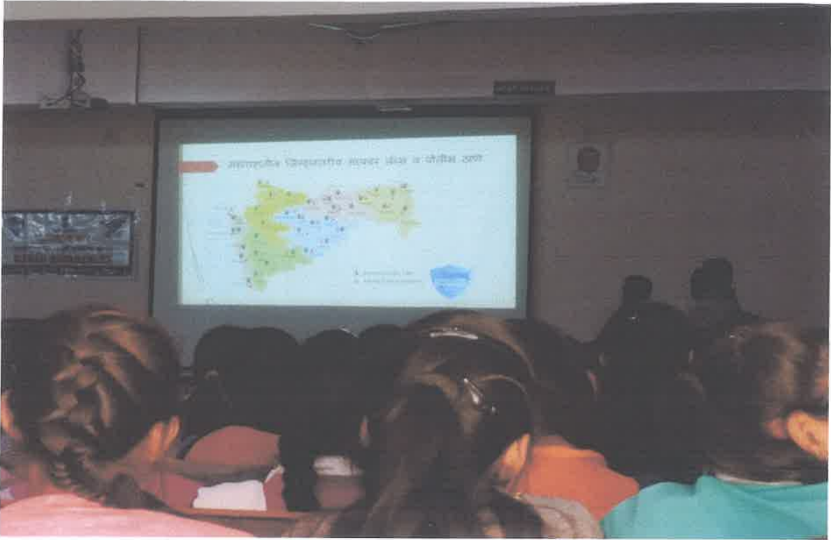
Power Point presentation of cyber security to college students. slide 1