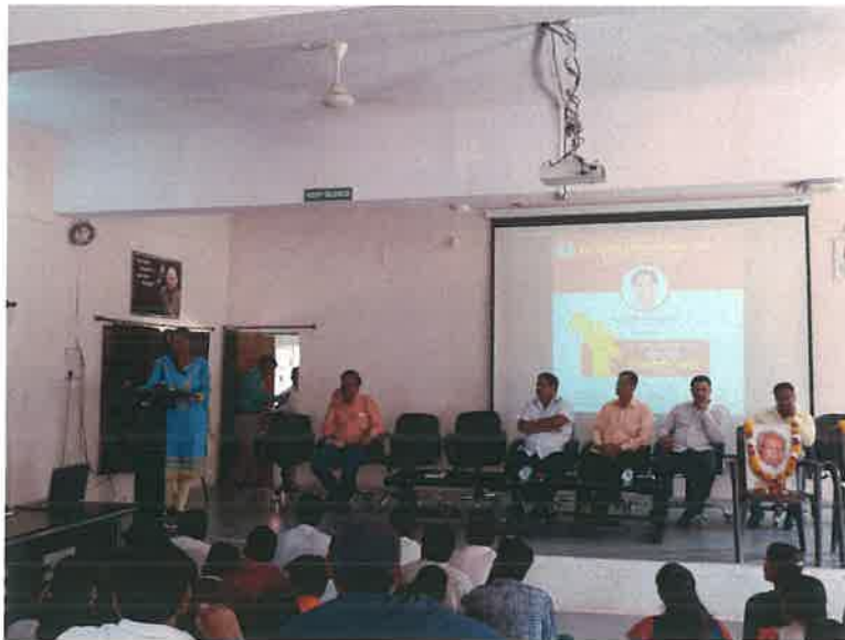
A Student expressing her views in Marathwada Liberation Day Program