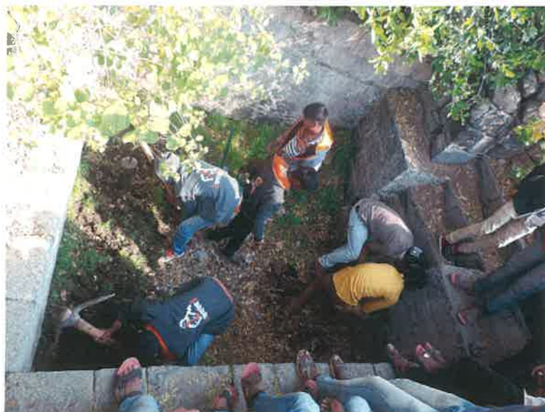
NSS Volunteers in sanitation Work.