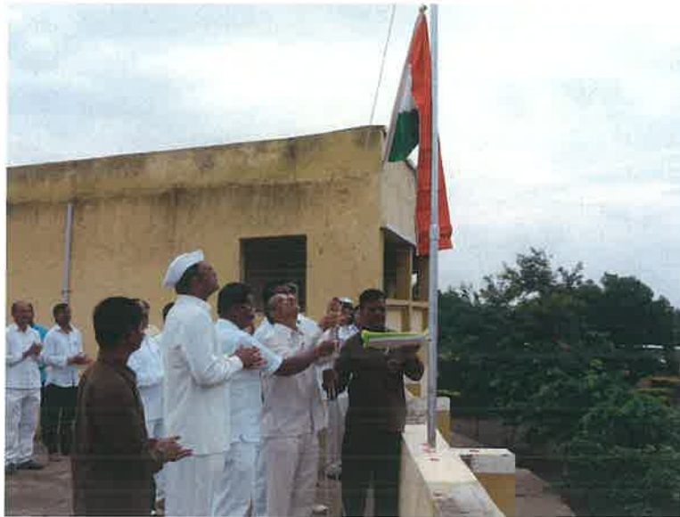
Celebrating 71th Independence Day Flag Hoisting at the hands of the guests.