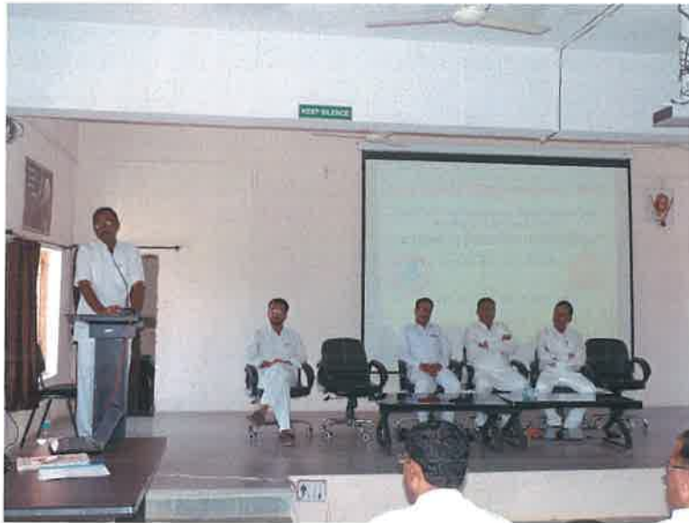
Dr. Babasaheb Ambedkar Marathwada University 59th Foundation Day Principal Message.