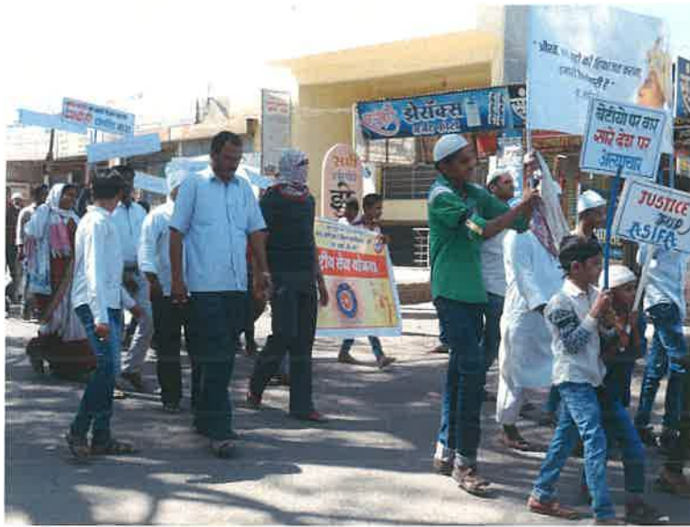
Hon. Principal and Students in rally.