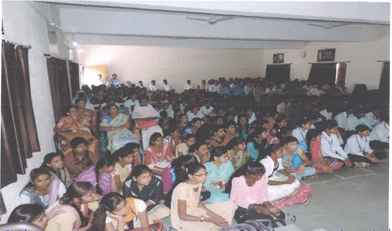
College students at financial literacy workshop.