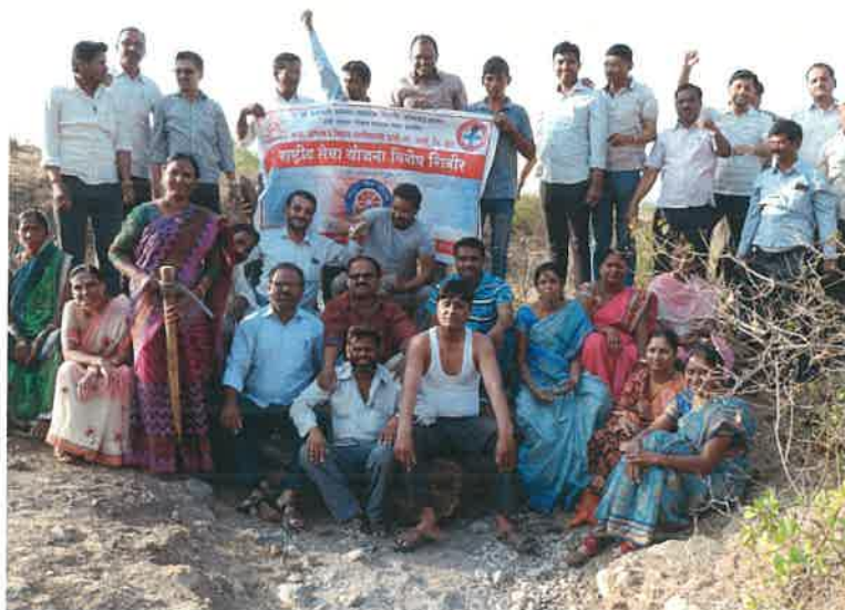
Staff after Completion of bounds (LBS)