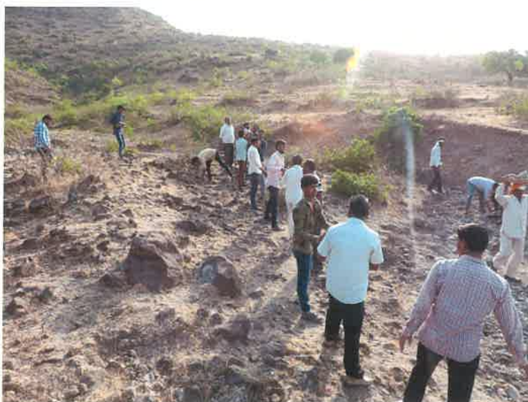
NSS Volunteers in Shramdan Shibir.