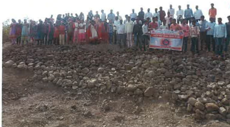
Staff and Students after completion of Bunds.