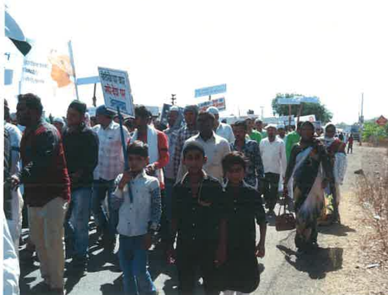
Participating Students in Rally.