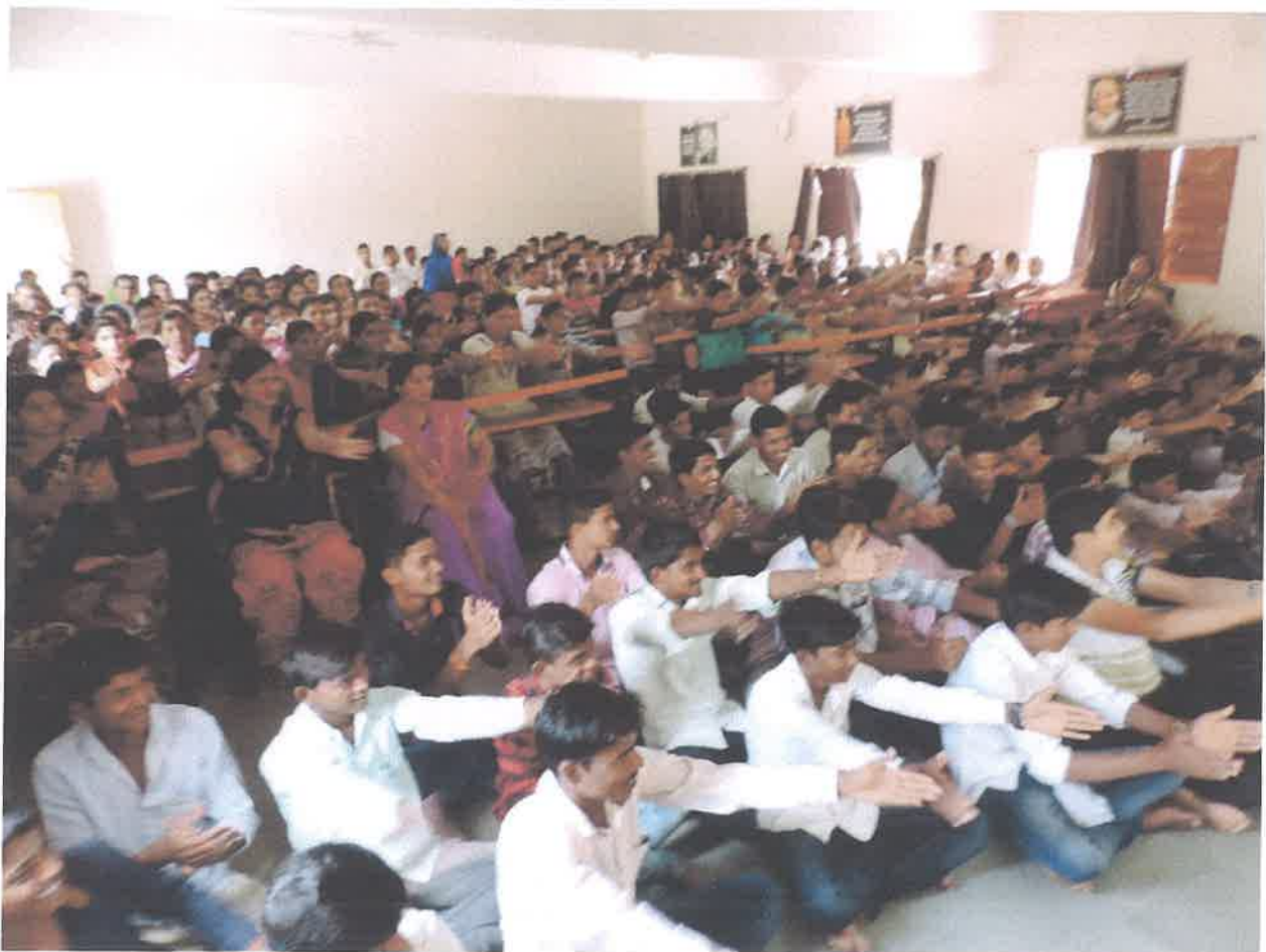
College students doing yoga exercise at International Yoga Day.